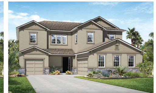
Elevation C - shown with optional stone